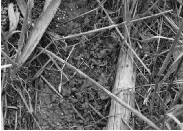
Worm casts on the surface of a 10 year old no-till soil. Surface residues provide food for earthworms as well as protection of pores created by their activity.

such as earth worms, which in turn form biopores that lead to improved permeability of the soil.